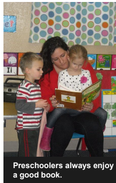
Preschoolers always enjoy a good book.