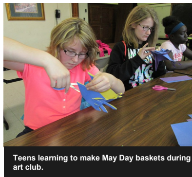
Teens learning to make May Day baskets during art club.

Teen Before and After School Program for Park Middle School Students held at the Center provides a structured, supervised and safe environment for middle school youth opens from 6:30 am to the start of the school day and resumes after school until 6:00 pm. This program provides transportation to and from Park Middle School. Our neighborhood based program is deeply committed to improving the teens academic performance while also building key leadership skills through various activities, community improvement projects and positive relationships. This program receives funding support from United Way and the "It Was Fun" Kenny Gardner Memorial Golf Tournament.