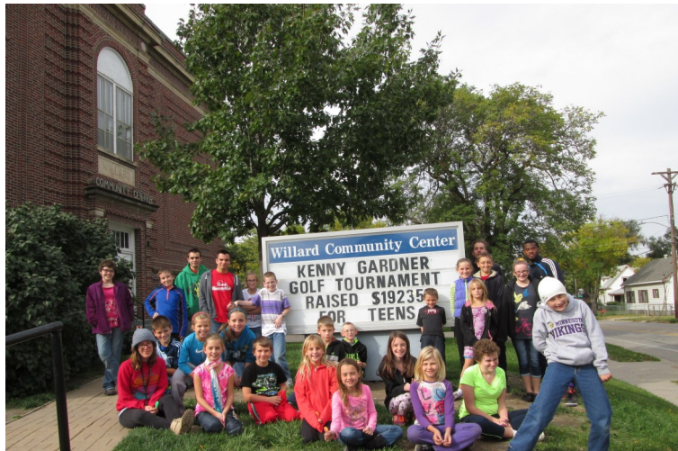
Teens celebrate the success of the 10th Annual Kenny Gardner Golf Tournament.