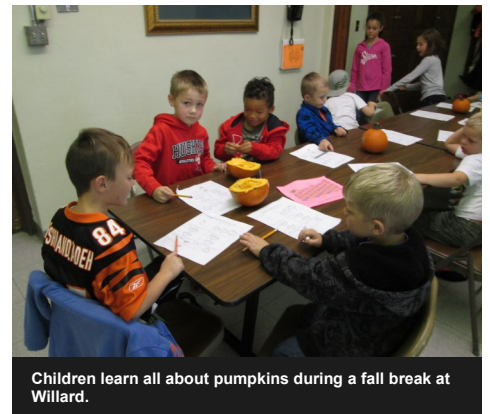
Children learn all about pumpkins during a fall break at Willard.

Lakeview Community Learning Center Before and After School Program held at 300 Capitol Beach Blvd. opens from 6:30 am to the start of the school day and resumes after school until 6:00 pm. Willard is the lead agency for this CLC and receives additional funding from the 21st Century Community Learning Centers Grant Program to support academic enrichment opportunities as well as additional activities designed to compliment the school's academic program. After school clubs are offered to all students in the school at no charge. Unduplicated number of children in this program attending 30 days or more was 84.