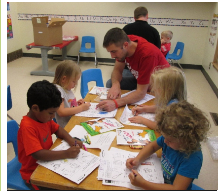
United Way Day of Caring volunteers from Lincoln Industries helped out at the Pre-k house. They led a reading activity with the children and even had time for a baseball game!