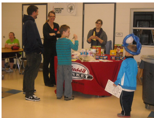
Families learn from Russ's Market how to make healthy food choices at the Health Fair in April.

The West "A" Neighborhood Health Fair was held at Roper Elementary School on April 13 th from 2-4 pm. The purpose of the Health Fair was to help West "A" residents meet the new health care professionals that have moved to this area including the Coddington Family Medical, Complete Children's Health, and Coddington Dental. Businesses like Russ's Market also added to the health theme by showing families how to make healthy food choices. With a $2000.00 grant from Community Health Endowment we were able to do the advertising, flyers, hire Homer the Saltdog mascot and the Balloon Lady, invite 23 vendors, and give away prizes. It was a great event. With over 100 people attending we hope this event continues to grow.